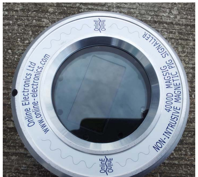
Top view enclosure