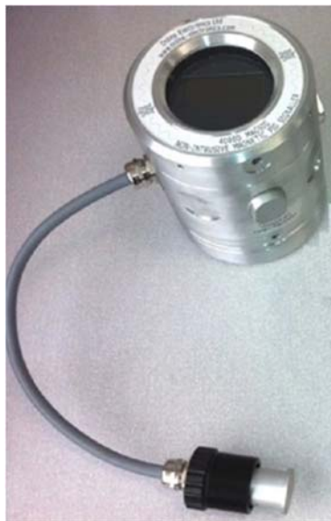
4001D MAGSIG PIG SIGNALLER